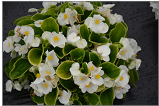
Sprint Plus White Begonia in bloom