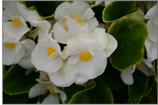
Sprint Plus White Begonia flowers

This is a high maintenance plant that will require regular care and upkeep, and usually looks its best without pruning, although it will tolerate pruning. Deer don't particularly care for this plant and will usually leave it alone in favor of tastier treats. Gardeners should be aware of the following characteristic(s) that may warrant special consideration;