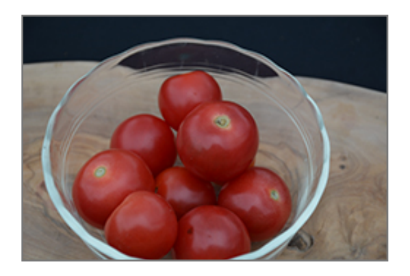
Husky Red Cherry Tomato fruit

Husky Red Cherry Tomato will grow to be about 24 inches tall at maturity, with a spread of 24 inches. When planted in rows, individual plants should be spaced approximately 3 feet apart. This fast-growing vegetable plant is an annual, which means that it will grow for one season in your garden and then die after producing a crop.