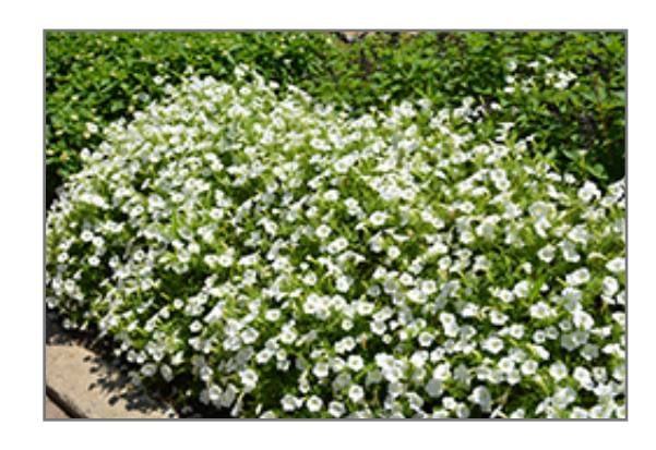
Supertunia Vista Snowdrift Petunia in bloom

This plant will require occasional maintenance and upkeep. Trim off the flower heads after they fade and die to encourage more blooms late into the season. It is a good choice for attracting butterflies and hummingbirds to your yard, but is not particularly attractive to deer who tend to leave it alone in favor of tastier treats. It has no significant negative characteristics.