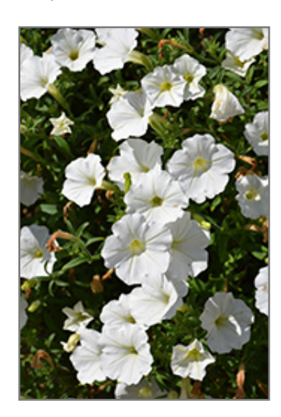
Supertunia Vista Snowdrift Petunia flowers