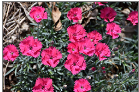
Paint The Town Magenta Pinks flowers