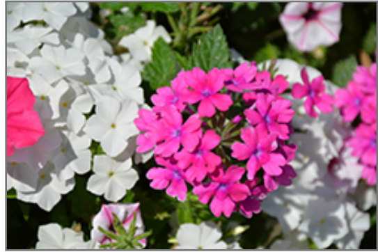
Superbena Pink Shades Verbena flowers

Superbena Pink Shades Verbena is recommended for the following landscape applications;