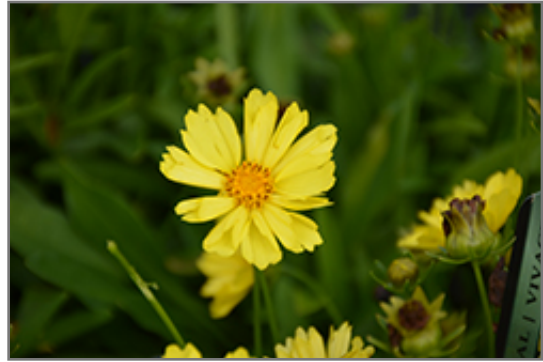
Leading Lady Sophia Tickseed flowers

Leading Lady Sophia Tickseed is recommended for the following landscape applications;