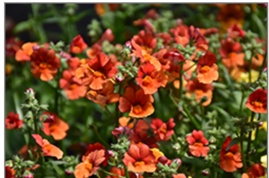
Sunsatia Blood Orange Nemesia flowers